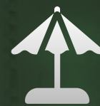
LA MER BEACH