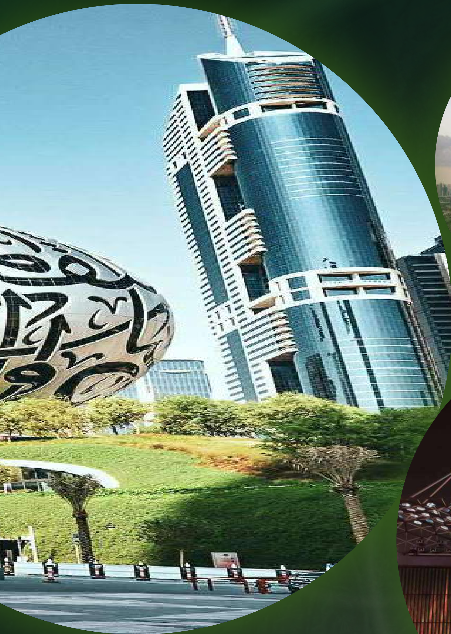
MUSEUM OF THE FUTURE