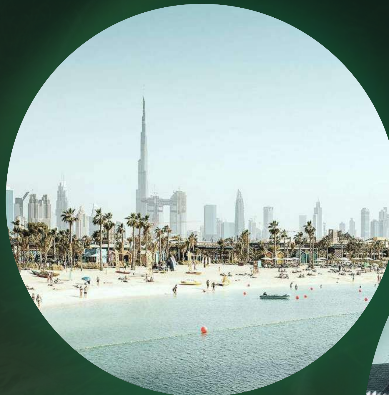
LA MER BEACH