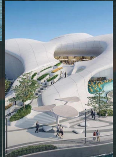
TEAMLAB PHENOMENA ABU DHABI