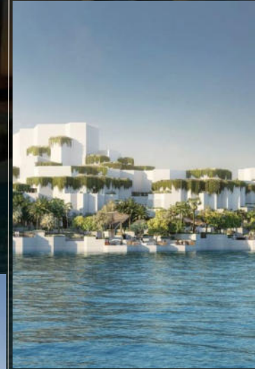
NATURAL HISTORY MUSEUM ABU DHABI