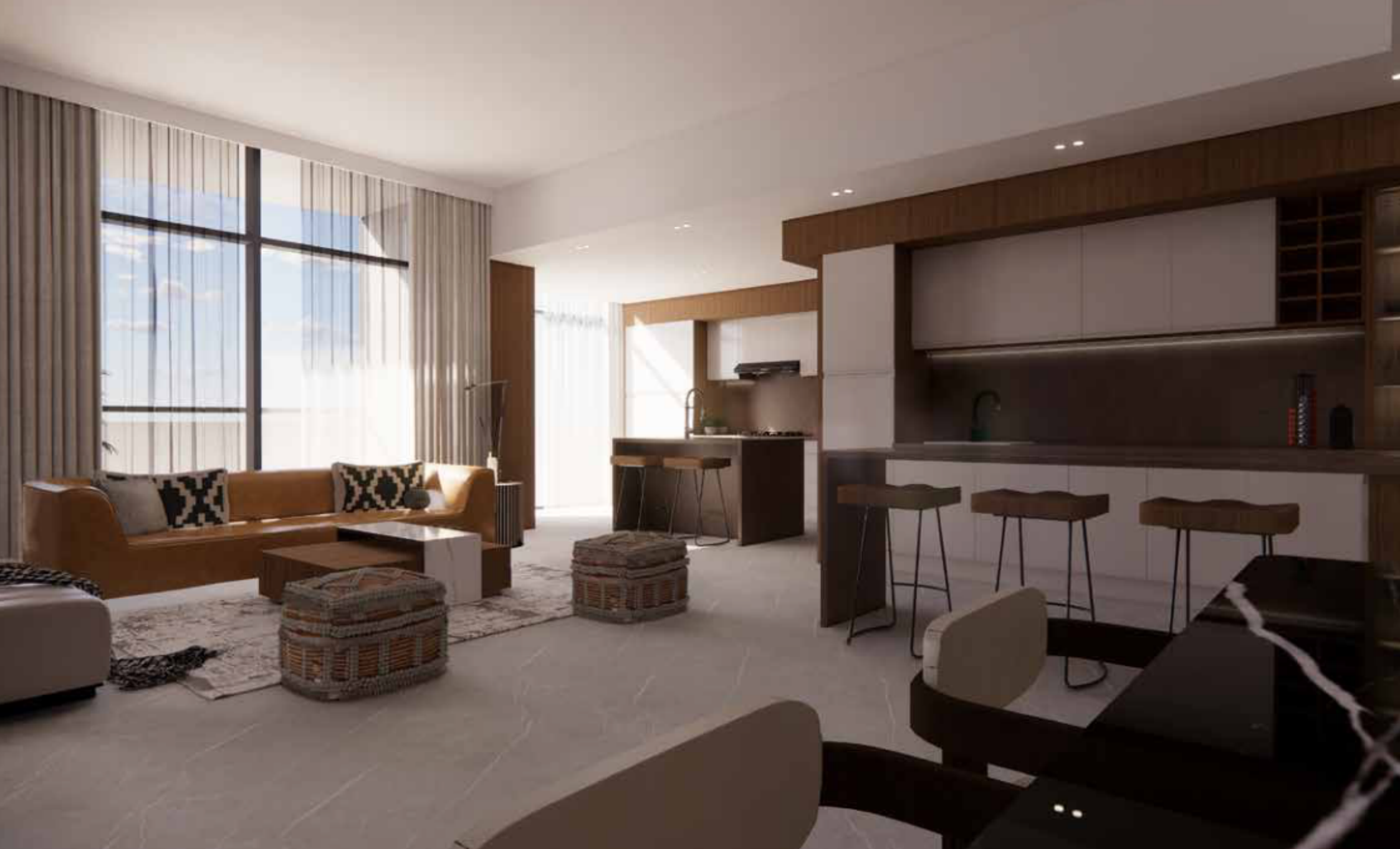
Open Living Areas