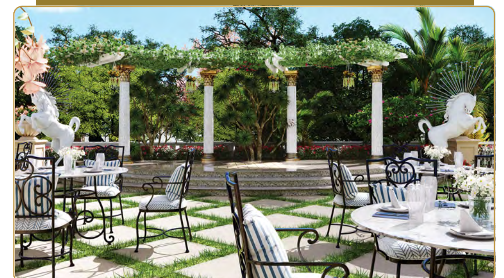
VENICIA RETREAT LOUNGE