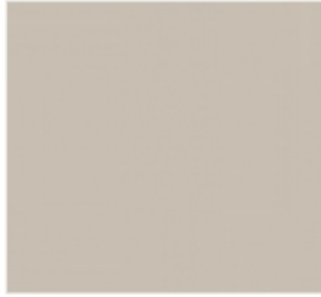
Walls & ceiling: Paint