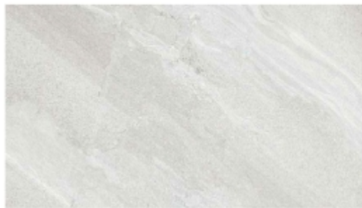
Bathroom wall Porcelain tile