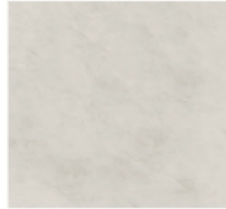
Counter top: Engineered stone