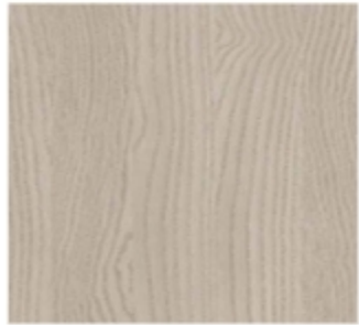
Upper cabinet: Laminate