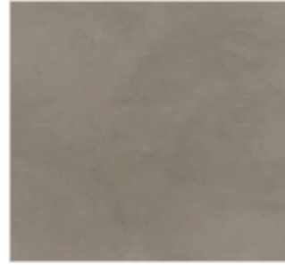
Apartment floor: Porcelain tile