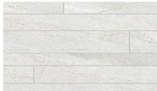
Shower wall: Porcelain tile