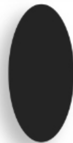
Sanitary ware Coffee