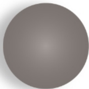
Sanitary ware Coffee