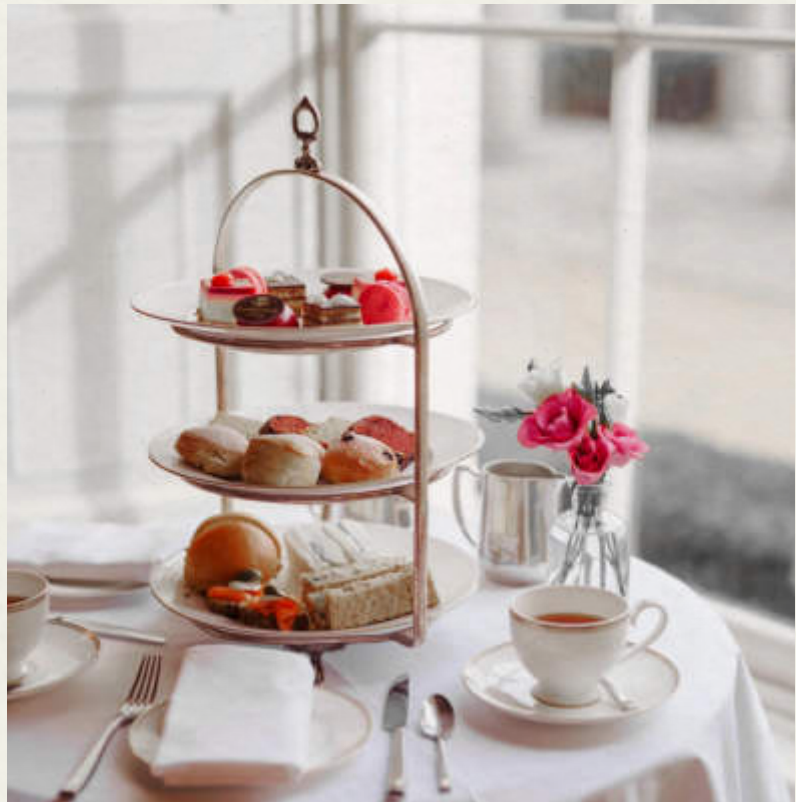
Classic High Tea