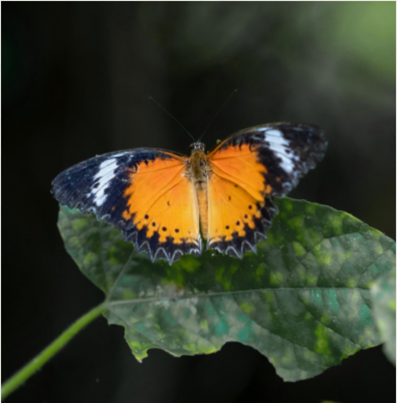
Lush Mediterranean Gardens