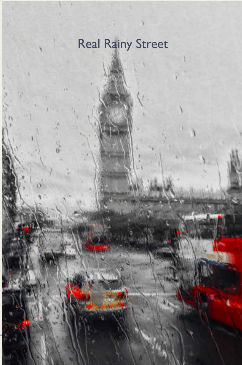
Real Rainy Street