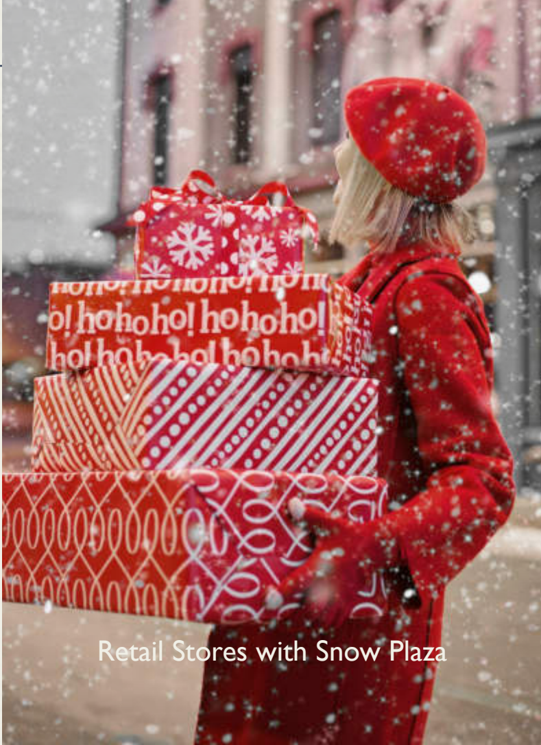
Retail Stores with Snow Plaza