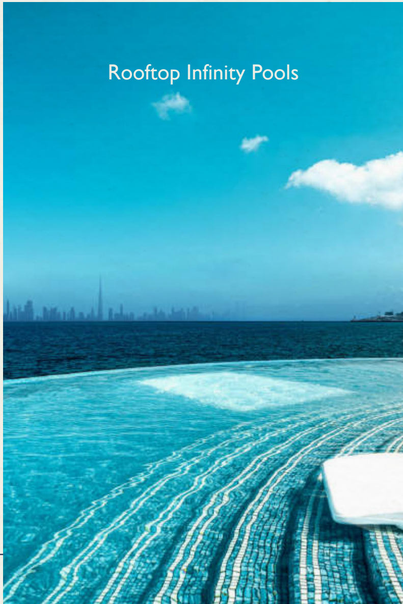
Rooftop Infinity Pools