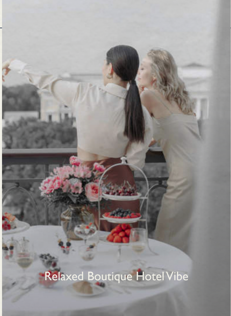
Relaxed Boutique Hotel Vibe