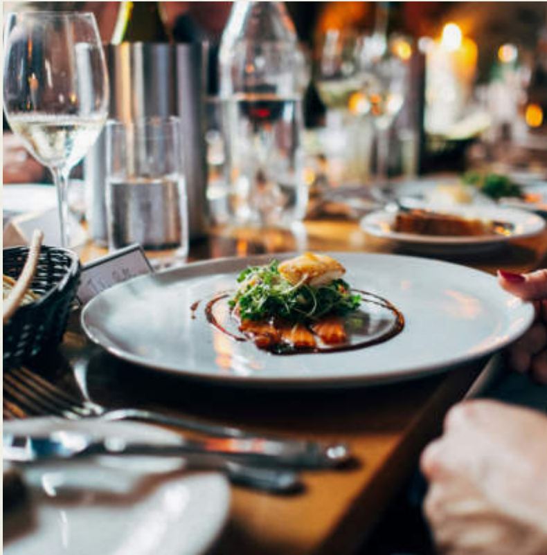
Authentic British Food