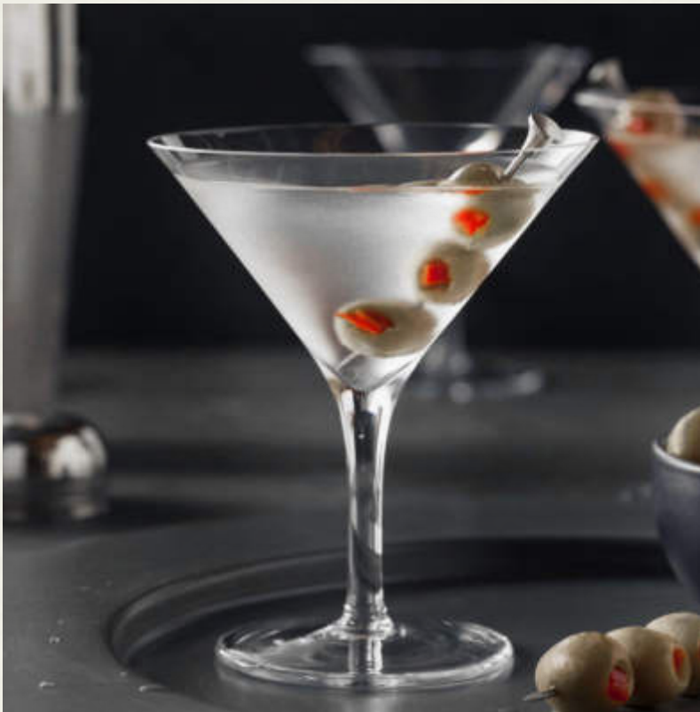
James Bond Themed Bar