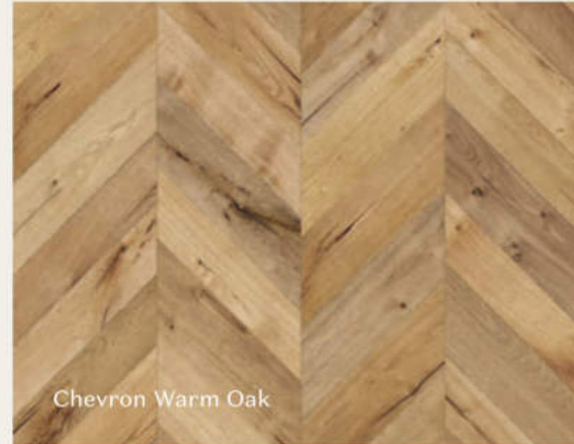
Chevron Warm Oak