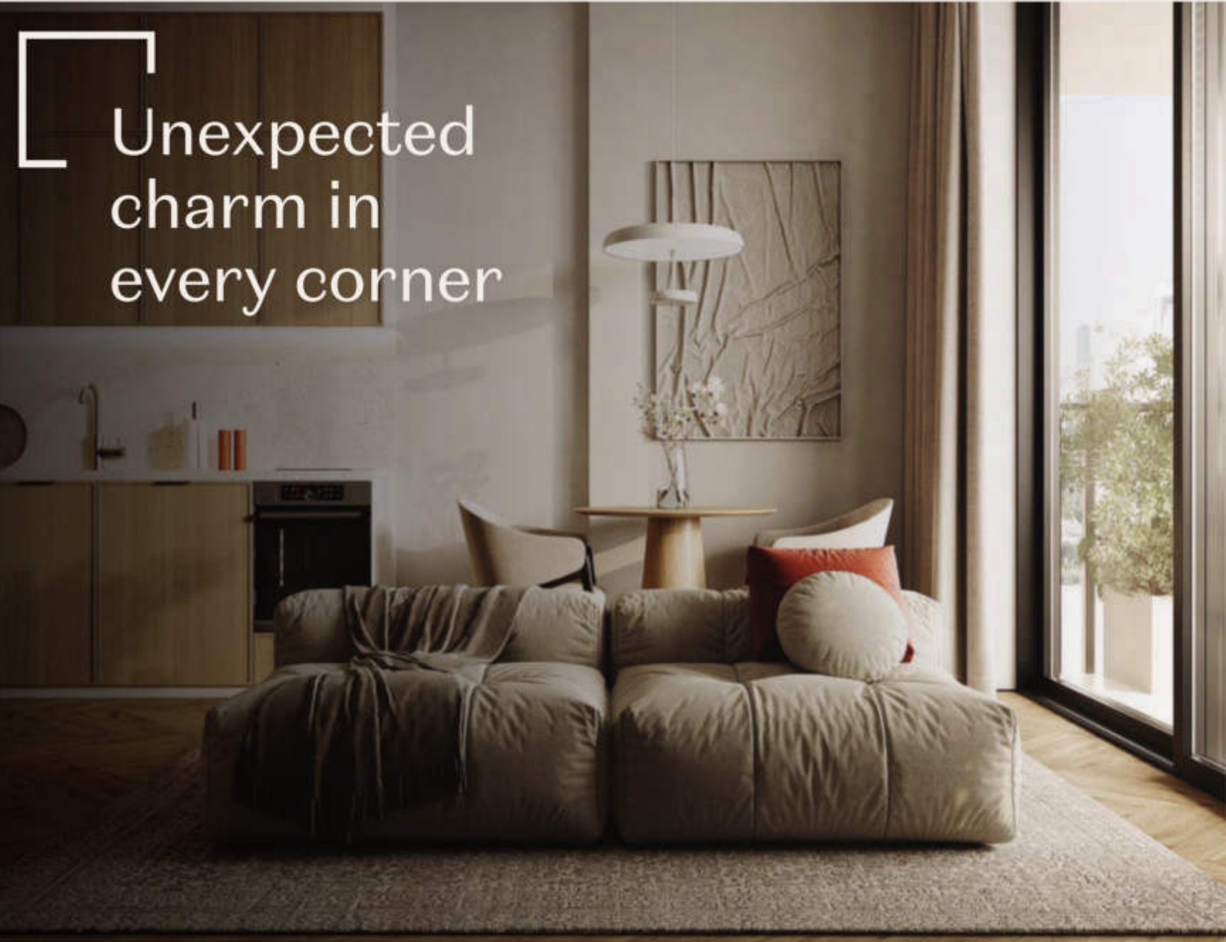
Arisha Terraces - Your Genuine Home