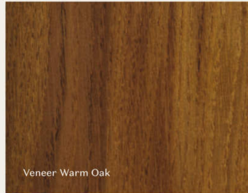
Veneer Warm Oak