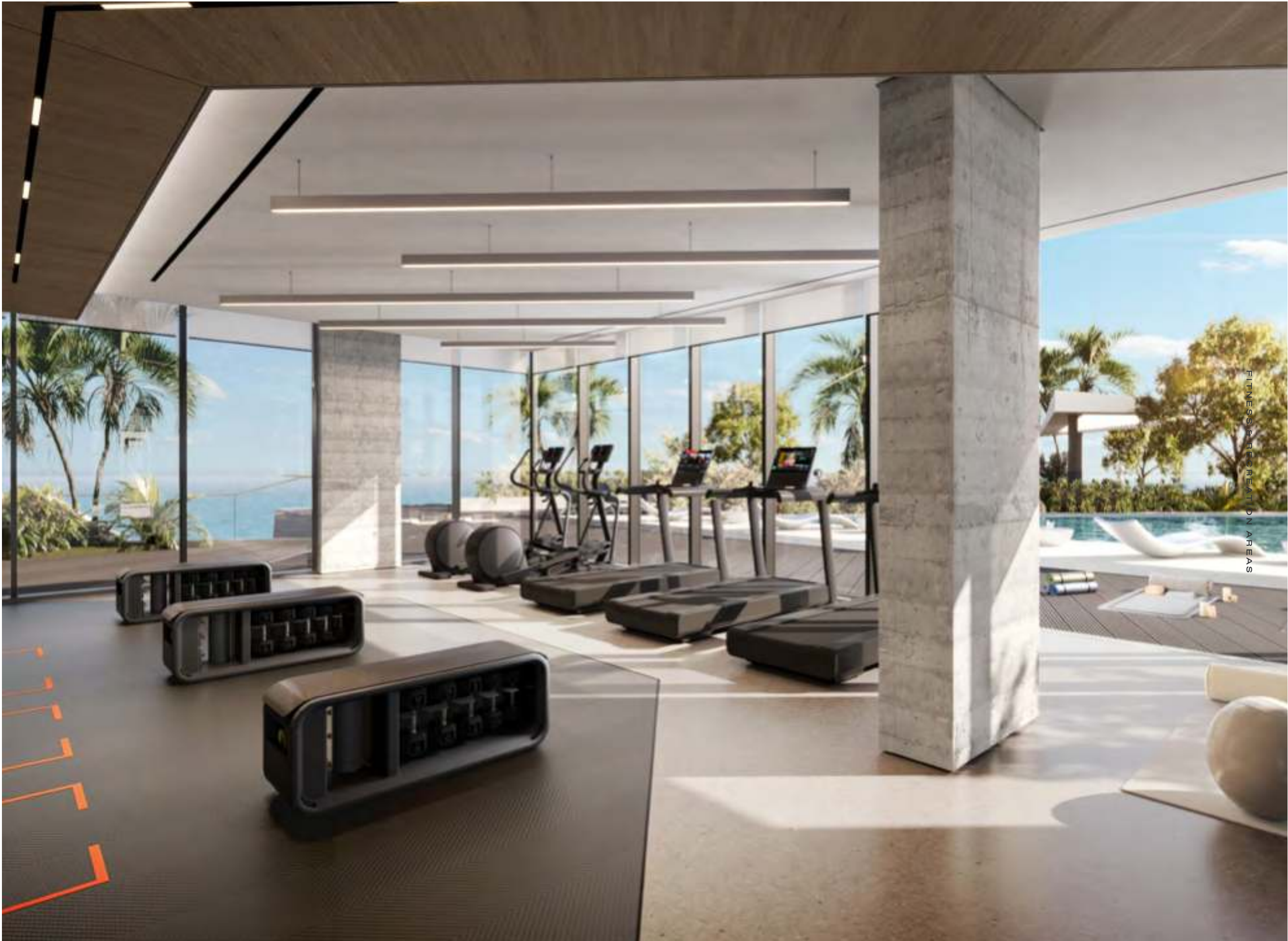
FITNESS & RECREATION AREAS