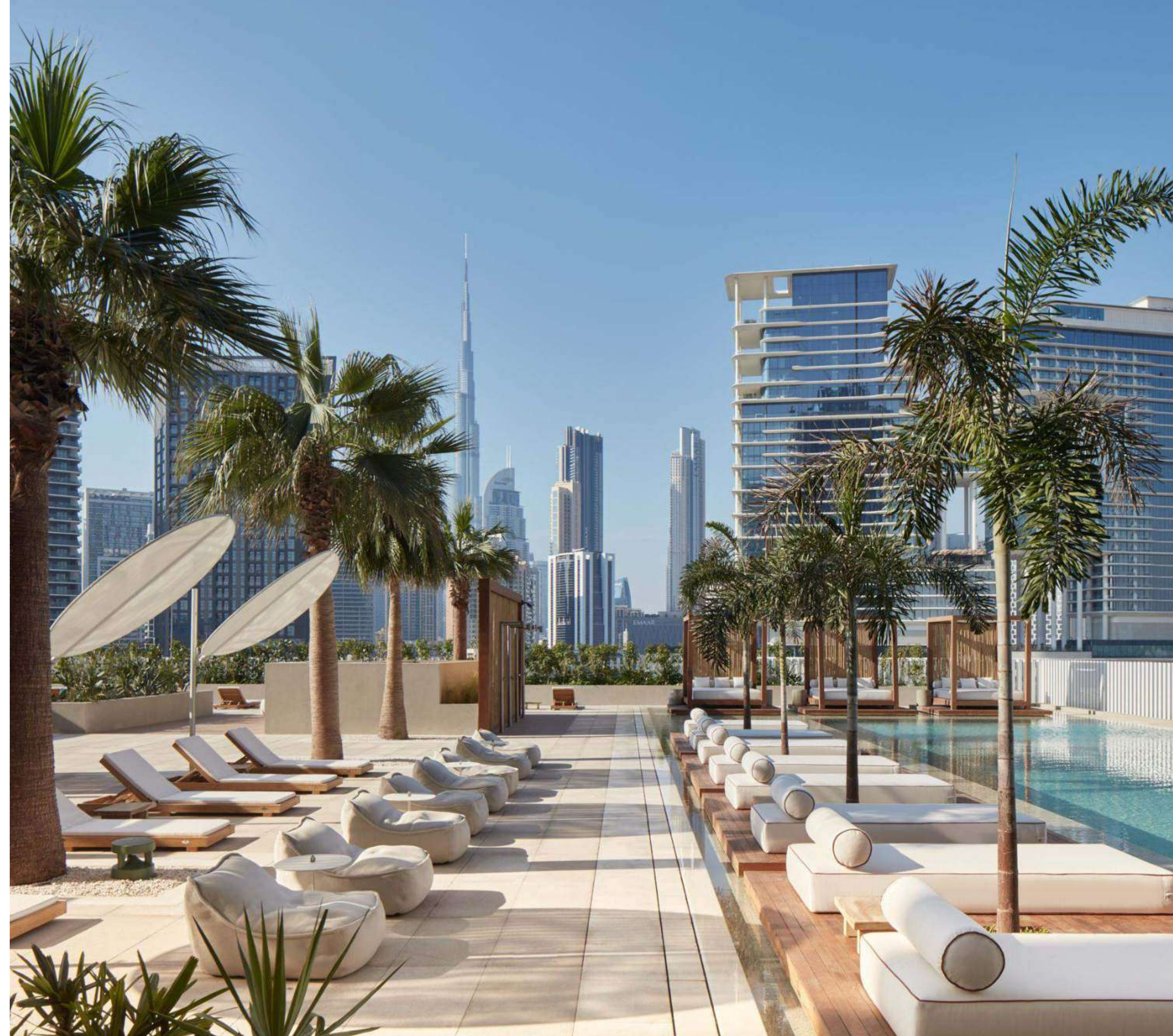
▲ UPSIDE LIVING, CONCEPTUALIZED AND DEVELOPED BY SRG HOLDING