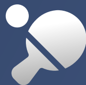
TABLE GAMES AREA