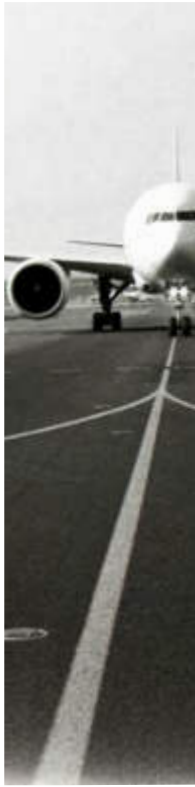
DUBAI WORLD CENTRAL AIRPORT