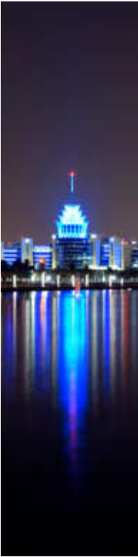
DUBAI SILICON OASIS LAKE