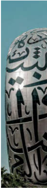
MUSEUM OF THE FUTURE