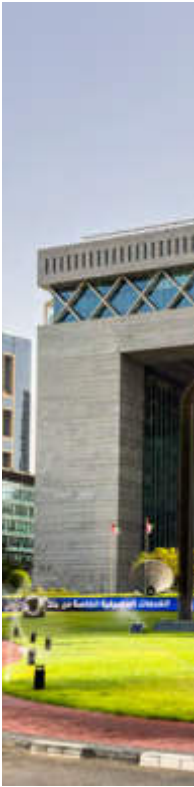
DUBAI INTERNATIONAL FINANCIAL CENTRE