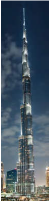
BURJ KHALIFA/ DUBAI MALL