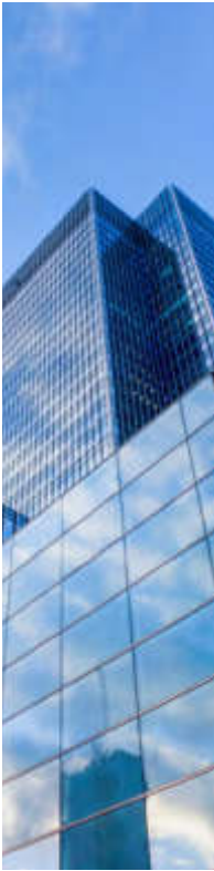
DUBAI DIGITAL PARK