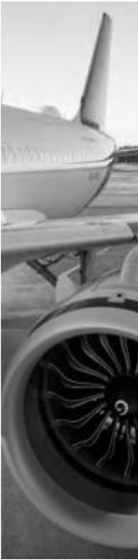
DUBAI INTERNATIONAL AIRPORT