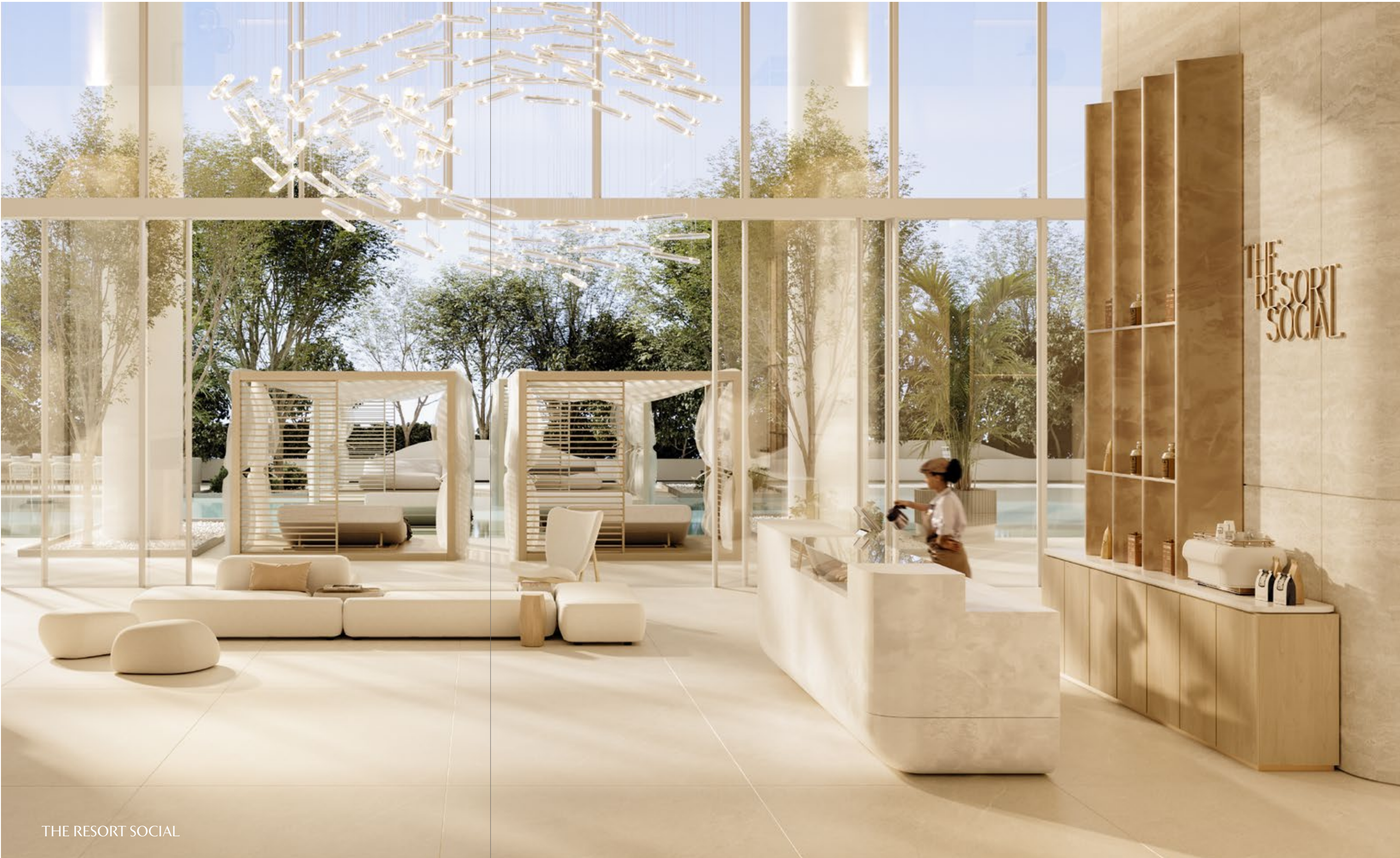
THE RESORT SOCIAL