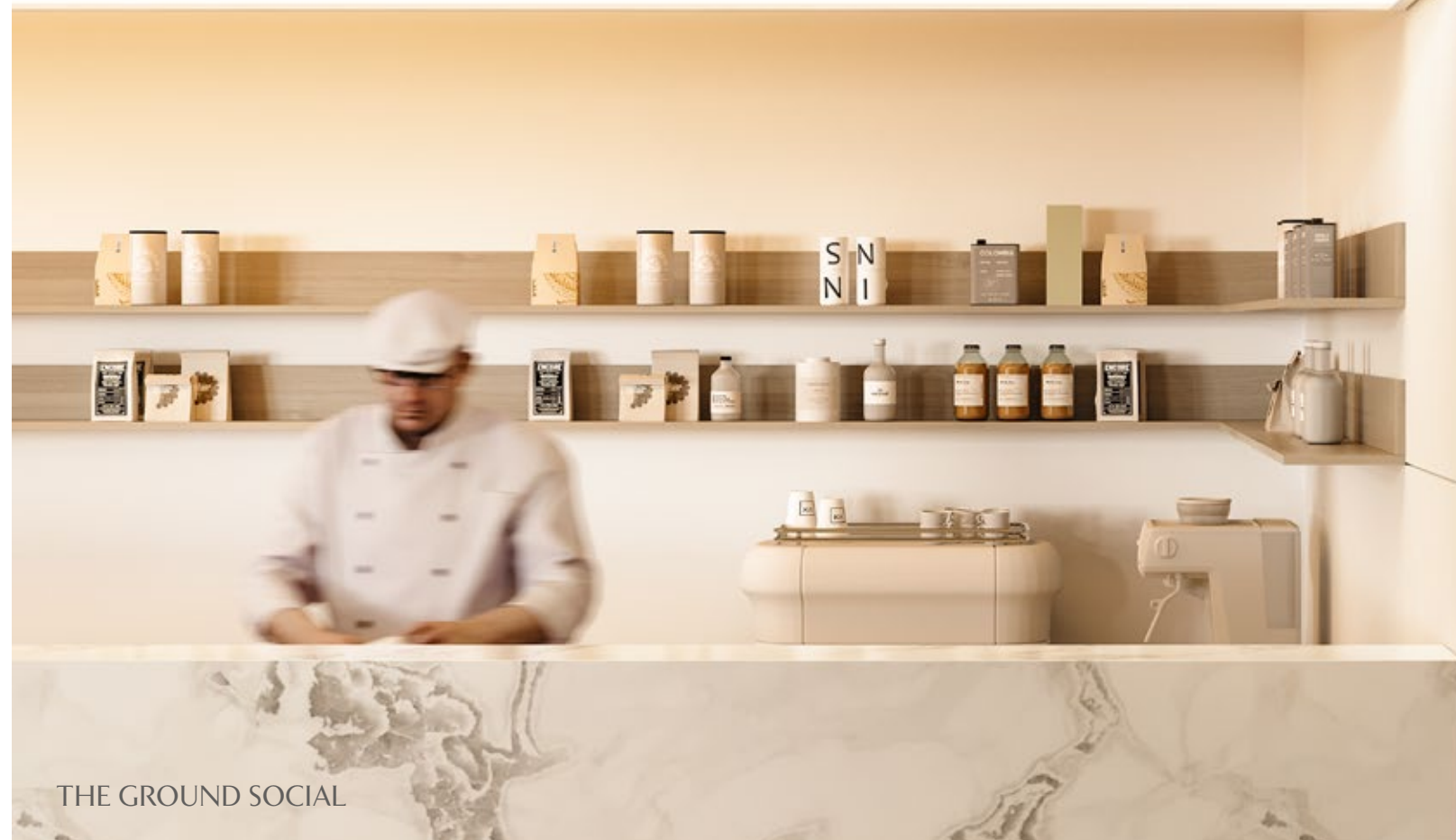
THE GROUND SOCIAL